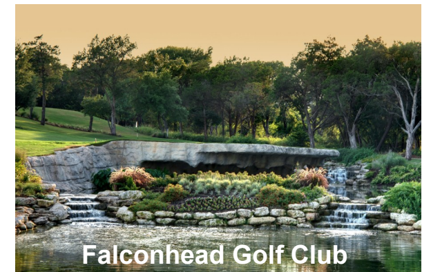
Falconhead Golf Club

Don't have a team? We will build foursomes.