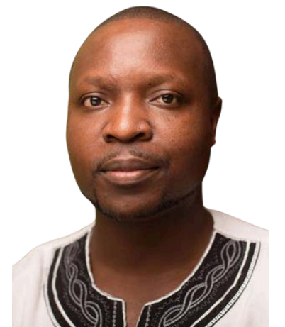
William Kamkwamba The Boy Who Harnessed the Wind Moving Windmills