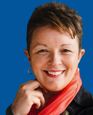
Angela TenBroeck Center for Sustainable Agricultural Excellence & Conservation